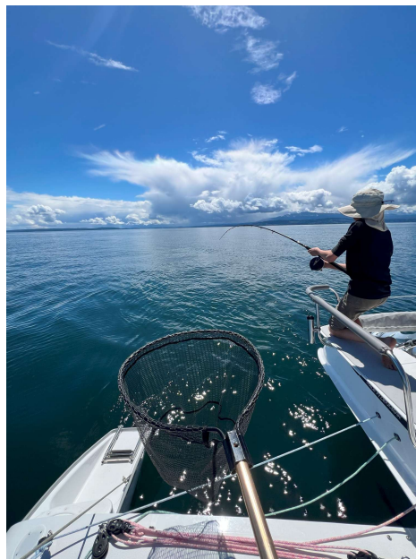
There is never a dull moment on a fun sailboat