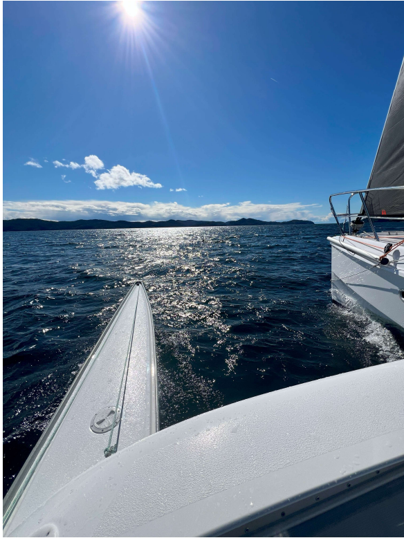
On our way averaging 8 knots