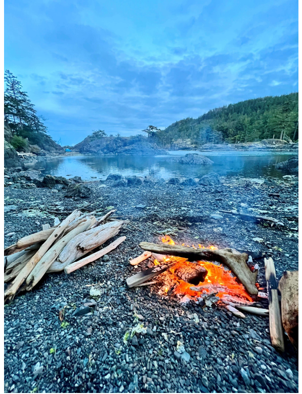
Because it's about simple pleasure