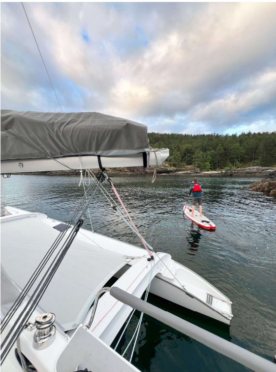
The trampolines are great to blow up a SUP or napping