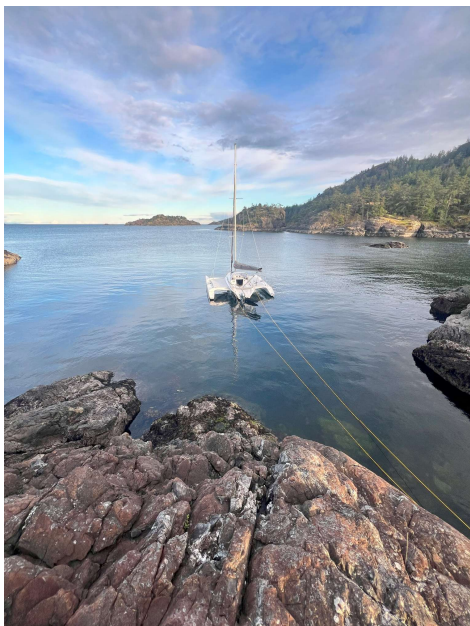
Anchorage at Jedediah island

Once we arrived at port, we all had a twinge of sadness. We didn't want to go back to our daily tasks, but at least we came back to shore with lots of energy and beautiful memories. The Dragonfly is the perfect sailboat for busy workers who want to recharge their energy quickly or for retirees who would like to visit further with ease.